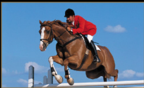
25-ACRE EQUESTRIAN FACILITIES