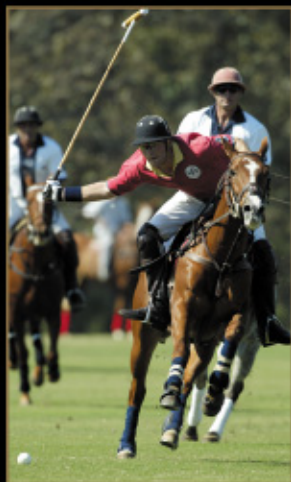
25-ACRE POLO FIELD AND TRAINING TRACK